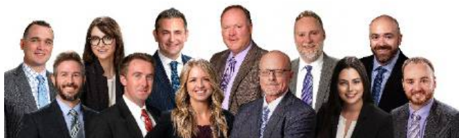
Gatti Law Firm Personal Injury