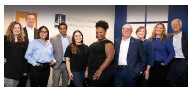
Bridge City Law Personal Injury