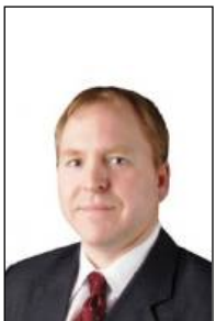
Deed Harrison DC Evidence Based